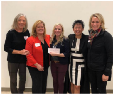
2018 Nonprofit Pitch Award Women in Successful Enterprises (WISE)

Why do we use this mentoring model? Doesn't that take away from the regular school day?