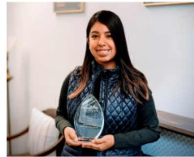
2020 Mentor Organization of the Year Grand Rapids Young Professionals