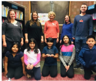
2019 Nonprofit of the Year Grand Rapids Chamber of Commerce