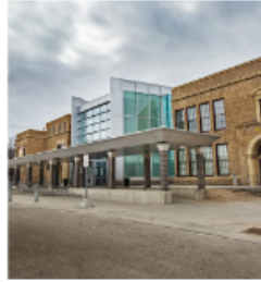
Burton Elementary and Middle School