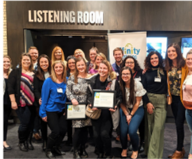
Gordon Food Service