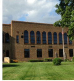
Lee Middle School