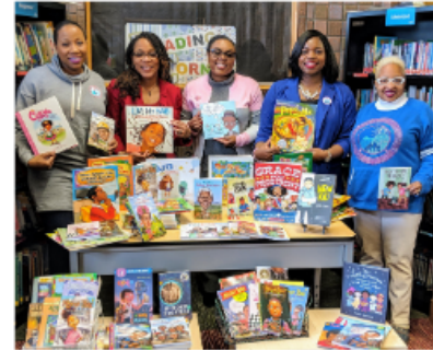
Greater Grand Rapids Chapter of Jack and Jill of America

The best, most innovative, and equitable work for students, schools, and families takes place when the whole community partners together. That is why we have clear models for businesses and organizations to participate in mentoring at Affinity through a variety of avenues .