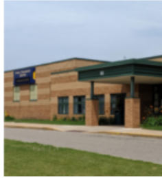
Early Childhood Center (ECC)