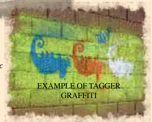
EXAMPLE OF TAGGER GRAFFITI